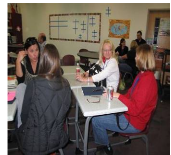
Spanish Teachers Delight in Sharing Ideas.

German teachers, please think seriously about presenting at our next October conference! Many of you have excellent ideas to share with all foreign language teachers.